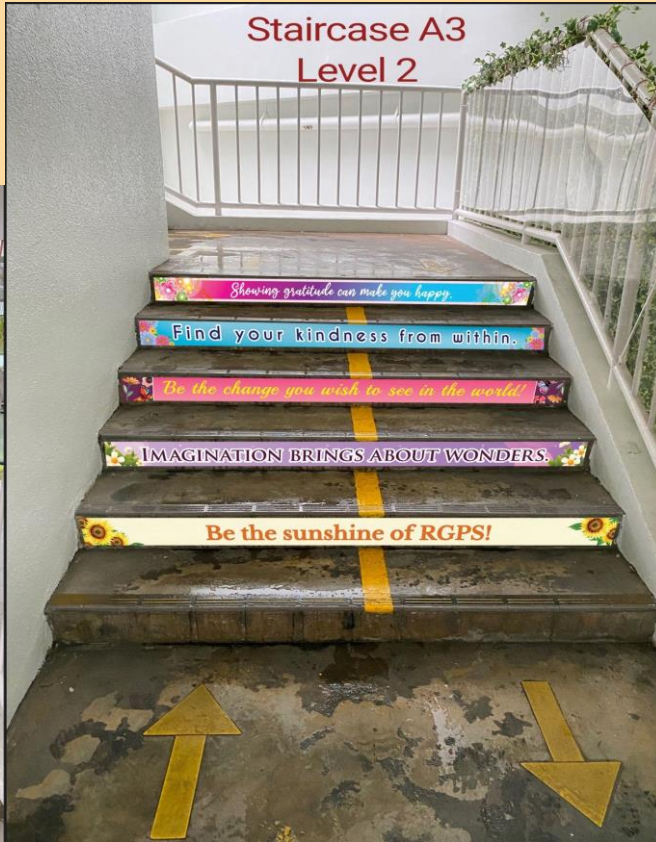
Staircase A3 Level 2